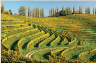
Slovenske gorice vineyards